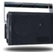
CP Series Yoke Mount (deployed horizontally)