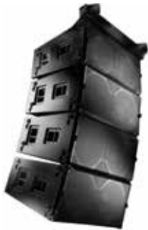
Four WL218-sw shown hung from AF218-sw