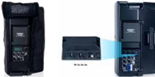
K.2 Series Outdoor Cover (rear flap opened)