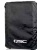
CP Series Cover