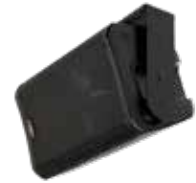
K.2 Series Yoke Mount (deployed horizontally)