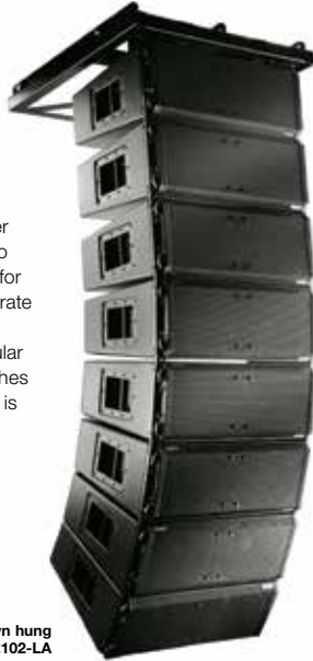
WL2102-w shown hung from AF2102-LA

The WideLine™ WL2102-w is a compact, high-output, wide dispersion line array loudspeaker system renowned for its ability to meet and exceed requirements for applications ranging from corporate meetings to large venue reinforcement of high-level popular music. From ballrooms to churches to concert venues, WideLine-10 is known for its full-range, warm, open, natural sound.