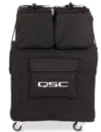
KS112 Cover with two K8.2 Totes