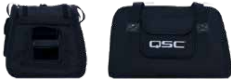
K.2 Series Totes