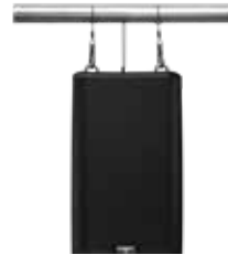
M10 Eyebolt Kit-C