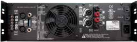
RMXa 3RU Models

RMXa Series amps are built upon the proven RMX amplifier line combining legendary QSC reliability and audio performance in a cost effective power amplifier solution. For mid-power applications, the 2RU (RMX 850a, RMX 1450a, RMX 2450a) models feature 4 \Omega power ratings from 300 to 800 watts per channel. For premium loudspeaker systems with extremely high power capacity, the 3RU (RMX 4050a & RMX 5050a) models offer unsurpassed value and performance.