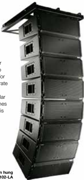
WL2102-w shown hung from AF2102-LA

The WideLine™ WL2102-w is a compact, high-output, wide dispersion line array loudspeaker system renowned for its ability to meet and exceed requirements for applications ranging from corporate meetings to large venue reinforcement of high-level popular music. From ballrooms to churches to concert venues, WideLine-10 is known for its full-range, warm, open, natural sound.