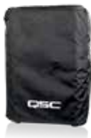
CP Series Cover