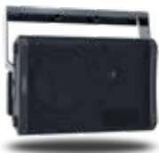
CP Series Yoke Mount (deployed horizontally)