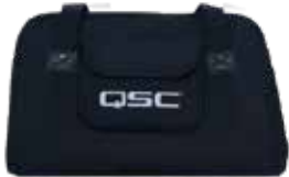
K.2 Series Totes