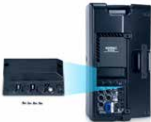
K.2 LOC (Lock-Out Cover)