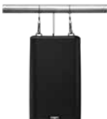
M10 Eyebolt Kit-C