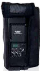
K.2 Series Outdoor Cover (rear flap opened)