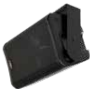
K.2 Series Yoke Mount (deployed horizontally)