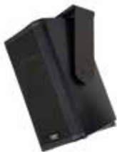
K.2 Series Yoke Mount (deployed vertically)