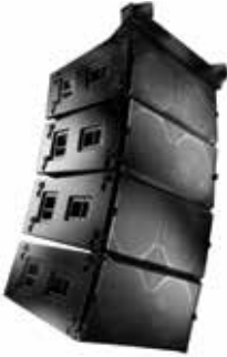
Four WL218-sw shown hung from AF218-sw