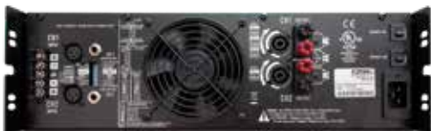
RMXa 3RU Models

RMXa Series amps are built upon the proven RMX amplifier line combining legendary QSC reliability and audio performance in a cost effective power amplifier solution. For mid-power applications, the 2RU (RMX 850a, RMX 1450a, RMX 2450a) models feature 4 \Omega power ratings from 300 to 800 watts per channel. For premium loudspeaker systems with extremely high power capacity, the 3RU (RMX 4050a & RMX 5050a) models offer unsurpassed value and performance.