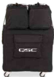
KS112 Cover with two K8.2 Totes